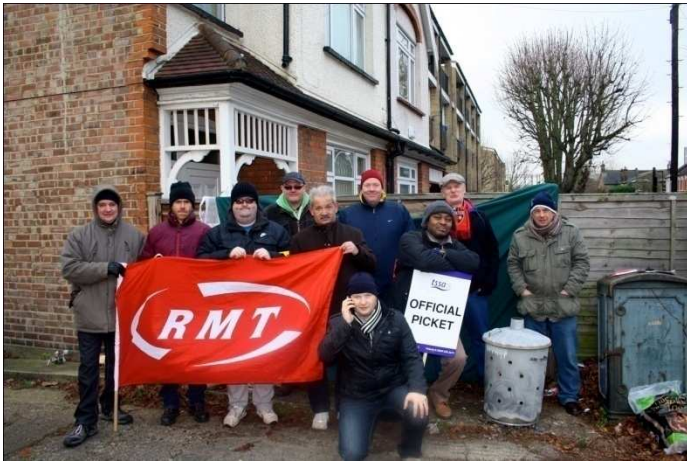
Arnos depot pickets brave the icy weather