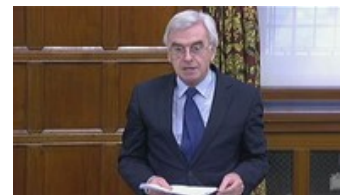
John McDonald MP

The Trade Unionists & Socialists Coalition, which RMT has supported in many local and National elections in recent years is planning to stand candidates in the London Borough elections in May who will all support RMT's aims and our strike action. Jenny Jones, Transport spokesperson for the Greens on the London Assembly also spoke at our rally as did Jeremy Corbyn MP. John McDonald, Labour MP and convener of RMT's parliamentary group secured a debate in parliament where several London MPs spoke against Boris's cuts.