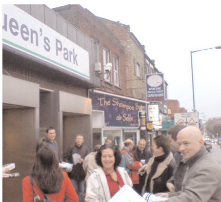
Striking station staff leaflet the public on their strike for safety.

Not one member of detrainment station staff came to work on the last strike day.