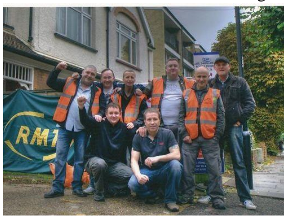
Pickets at Arnos Grove depot

Once again, TSSA members stood shoulder to shoulder with their RMT colleagues on the stations whilst a great many ASLEF drivers showed their