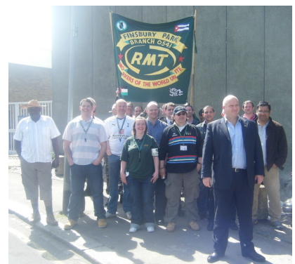
Bob Crow joins the picket line outside Seven Sisters depot

lines and helped distribute leaflets to the travelling public to explain how their safety was being put at risk by a penny-pinching company. Despite being inconvenienced, most people seemed glad to receive an explanation of why the strike was taking place.